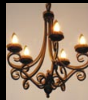
The Chapel Newstead combines the charms and ambience of a unique historic property with contemporary indulgences.