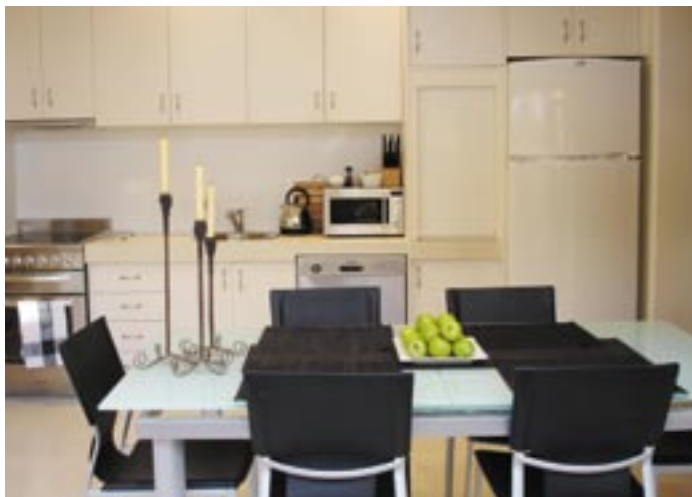
Full kitchen & dining facilities.