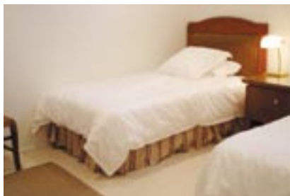
Two bedrooms. King-sized with ensuite. Twin King singles (can make another King). Sleeps 4 + child.