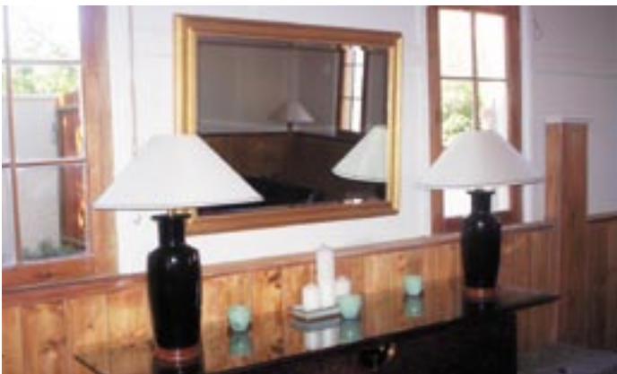
Original church room now used as a spacious lounge with stylish sofas, ottomans and furnishings.